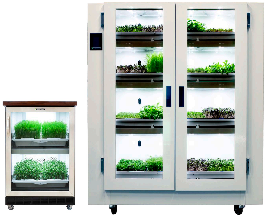
*Residential model shown with optional cutting board top